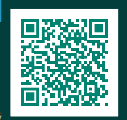
SCAN WITH SMARTPHONE

Additional information is available for viewing on the Roadway Production webpage at: www.pbcgov.com/engineering/roadwayproduction