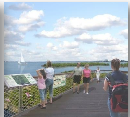
Location: Downtown West Palm Beach