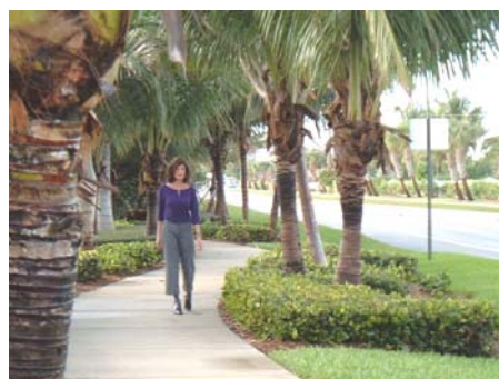
Pedestrian using new bicycle path along A1A in Jupiter