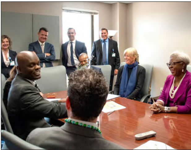
PBC Day Attendees meet with Representative Kionne McGhee.