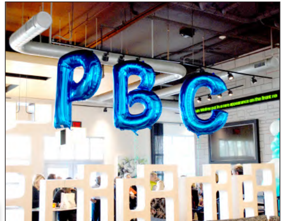
PBC Day 2019 at the Aloft Hotel

The registration process is easy, fast and can be completed in three easy steps: