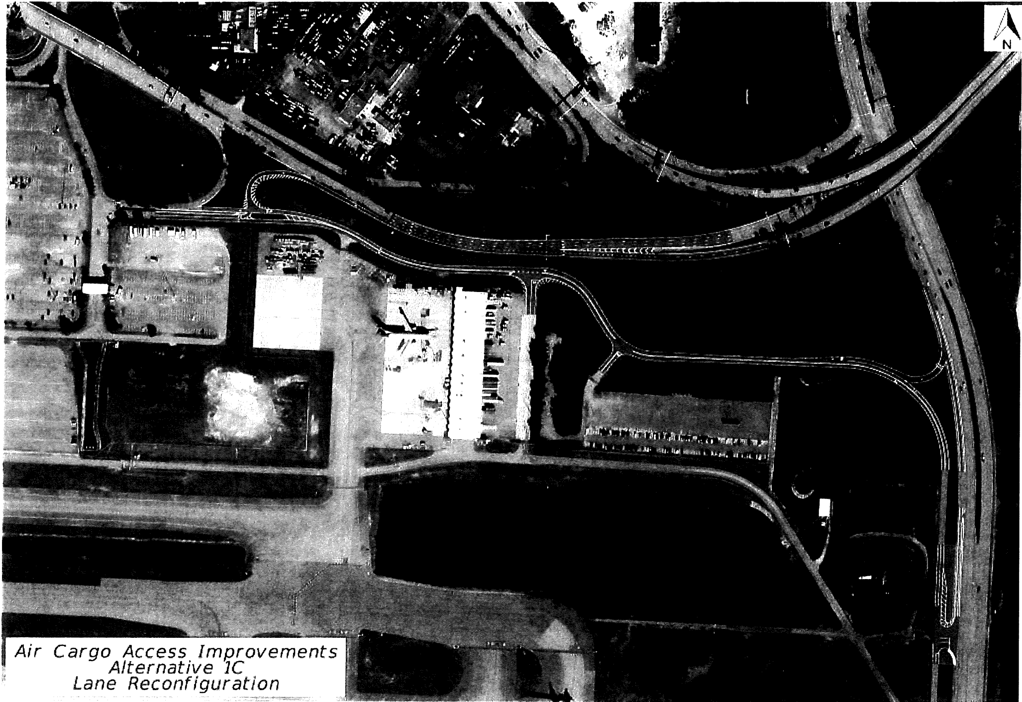
Air Cargo Access Improvements Alternative 1C Lane Reconfiguration