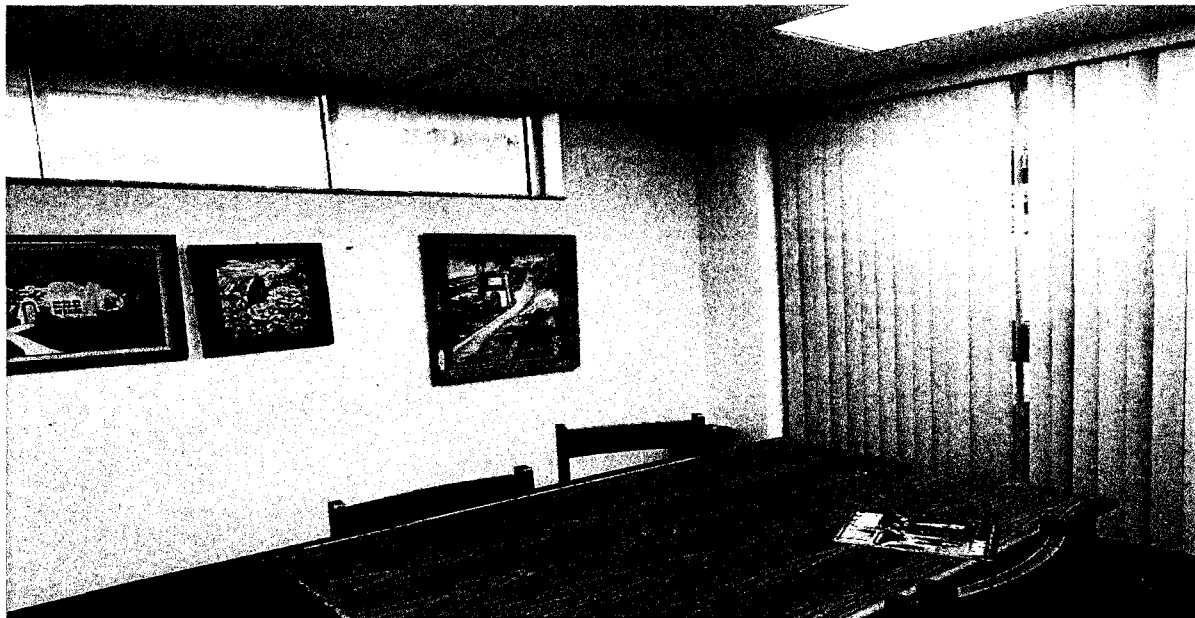
EXHIBIT "B" PREMISES