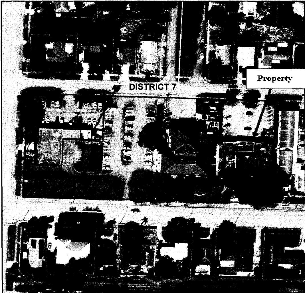
Town of Lake Park Library, 529 Park Avenue Lake Park, FL