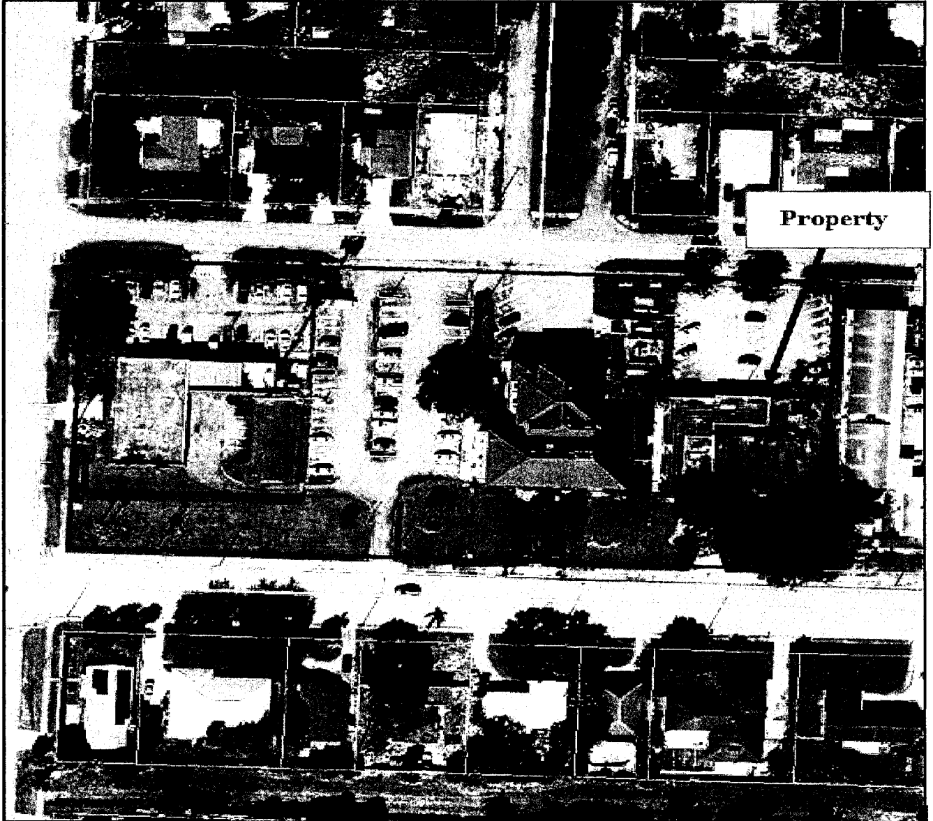
EXHIBIT "A" PROPERTY