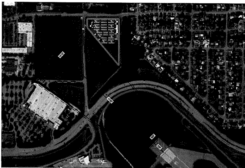
EXHIBIT "A" THE PROPERTY