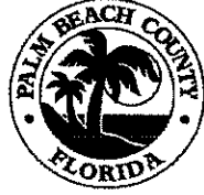
Exhibit A. Income Limits Chart